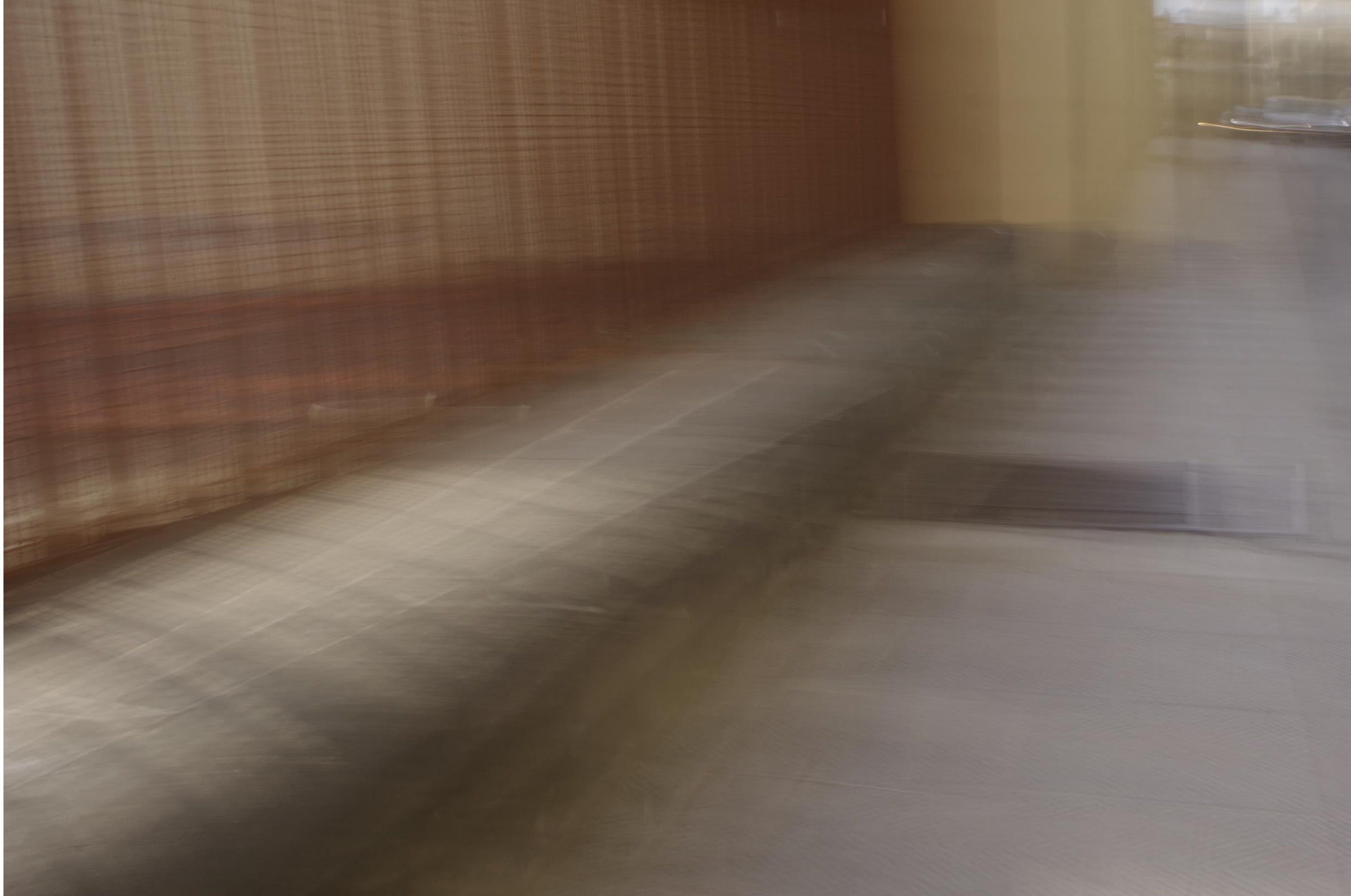
Walking at f/22 2020 10"x16" Digital Print