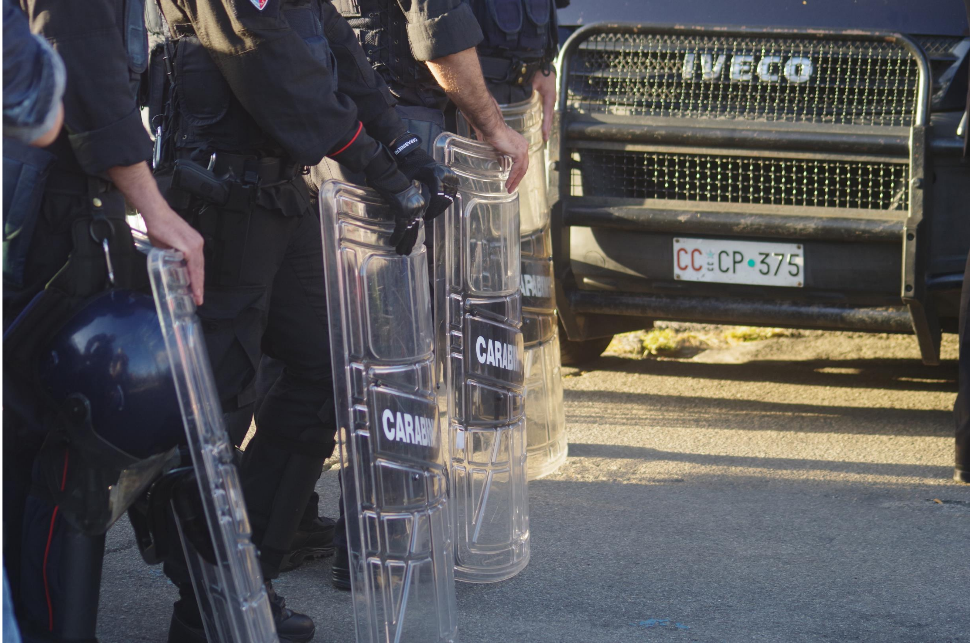
Carabinieri at BLM Protest 2020 10"x16" Digital Print