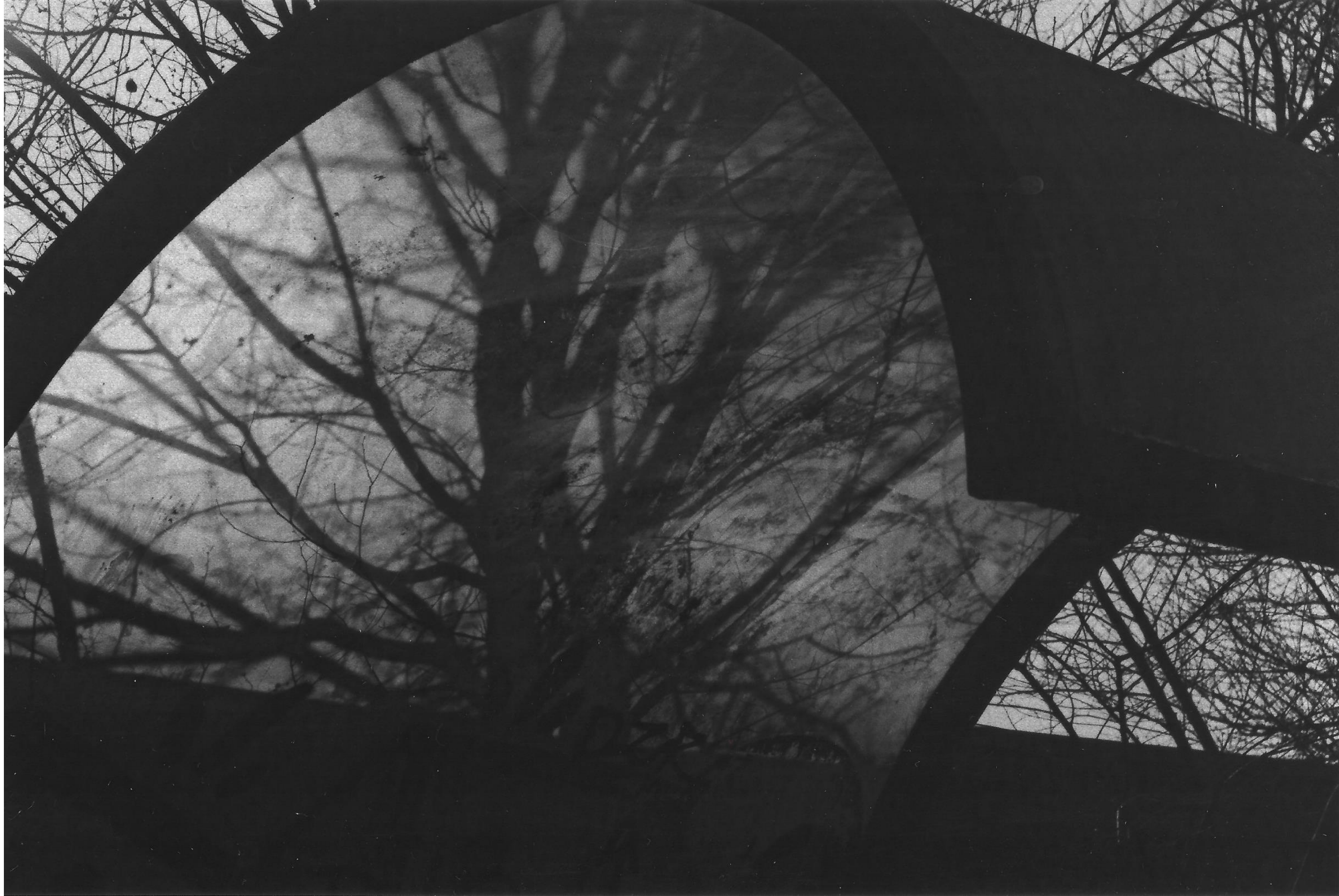
View from a Cobblestone 2020 10cm x 15cm Digital Negative, Silver Gelatin Print