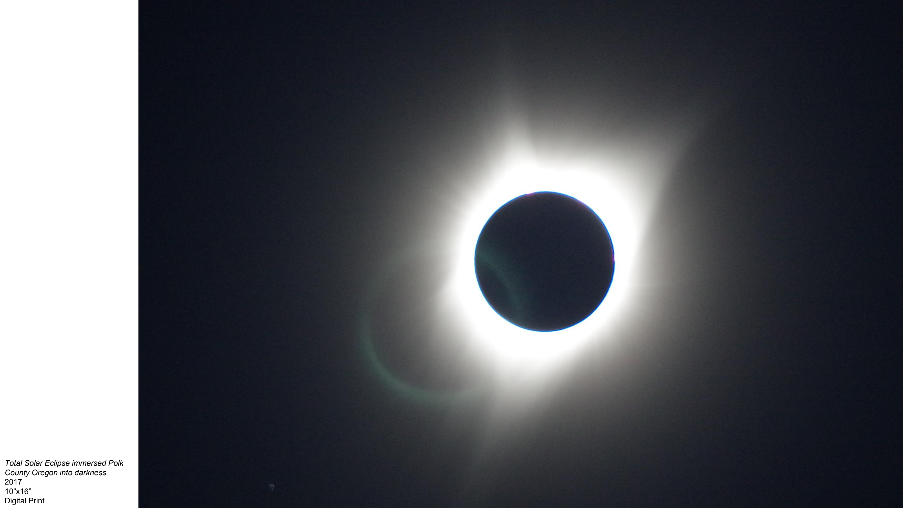
Total Solar Eclipse immersed Polk County Oregon into darkness 2017 10"x16" Digital Print