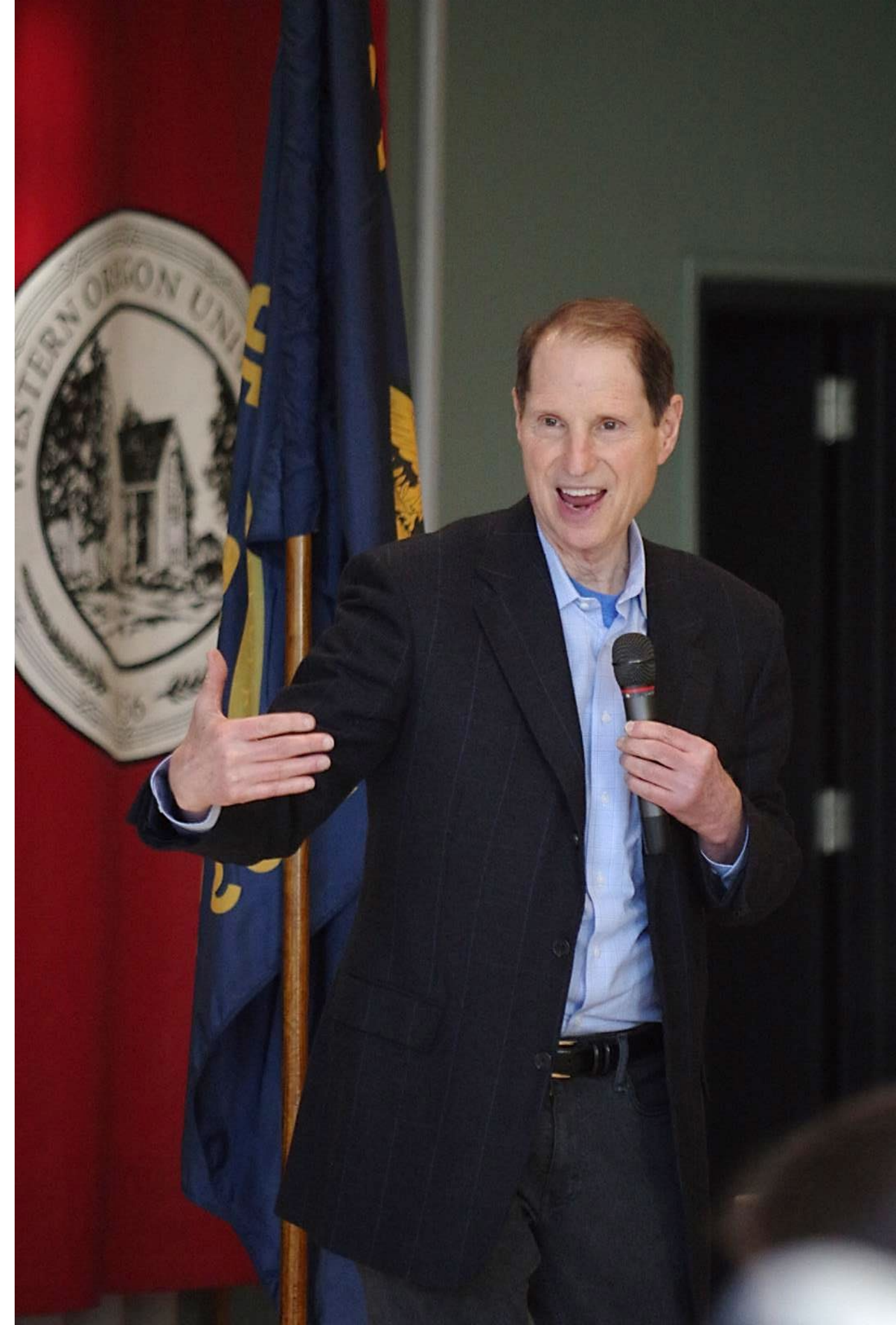
Senator Ron Wyden (D-OR) conducts Town Hall meeting at Western Oregon University 2018 10"x16" Digital Print