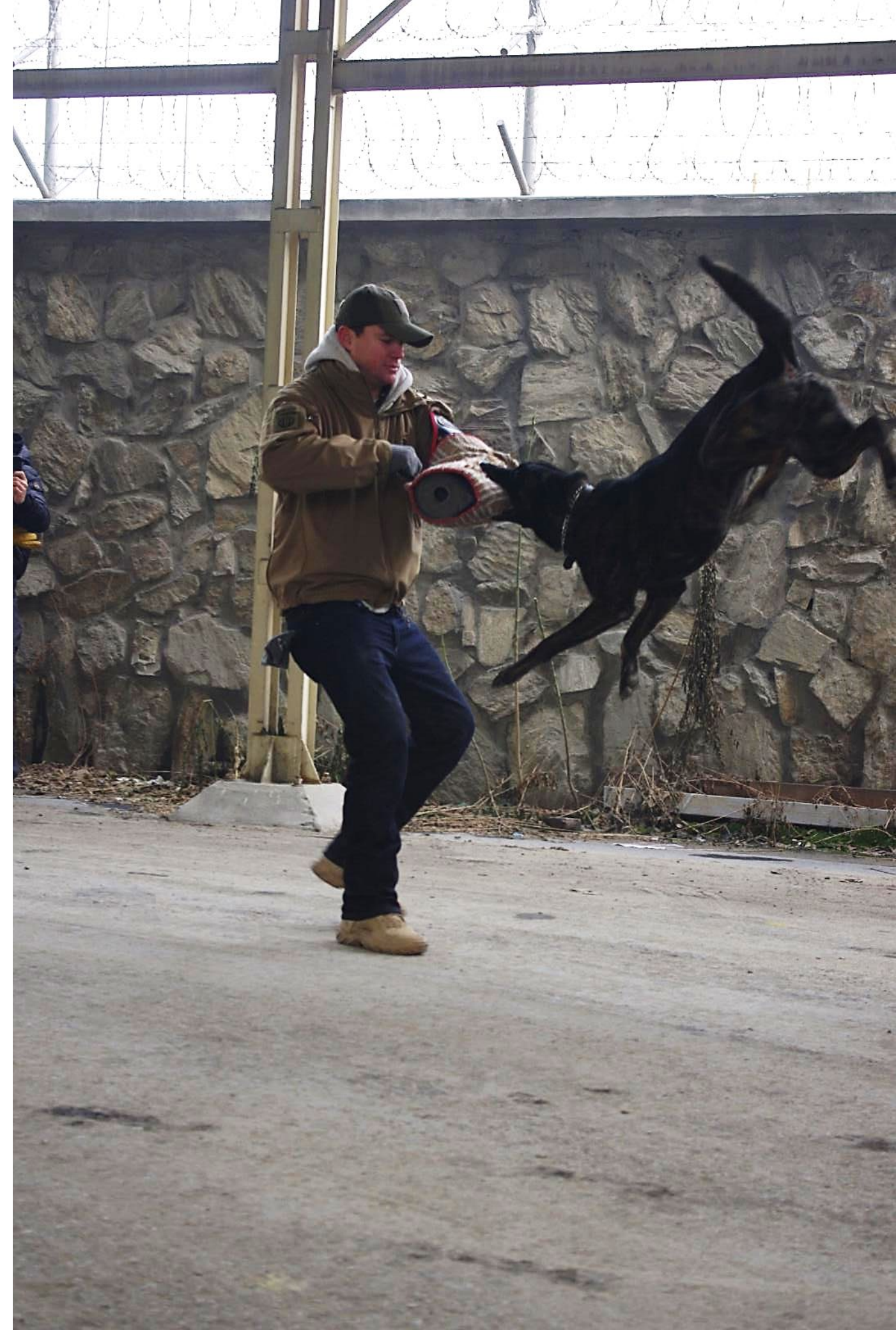
Actor Channing Tatum trains with K9 dogs at New Kabul Compound, Kabul, Afghanistan 2015 10"x16" Digital Print