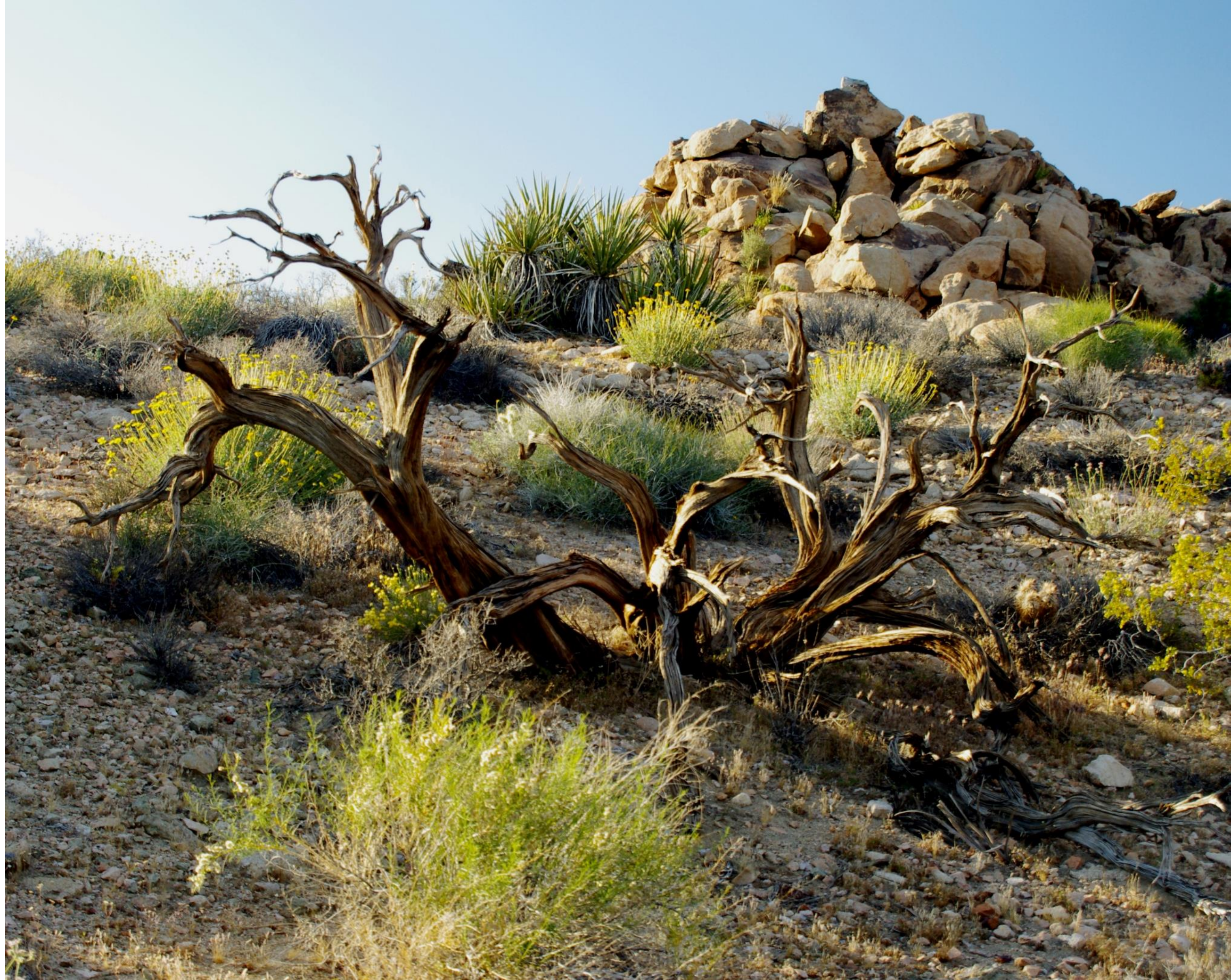
Shadows of Time 2011 16"x20" Digital Print Public Collection, Joshua Tree National Park