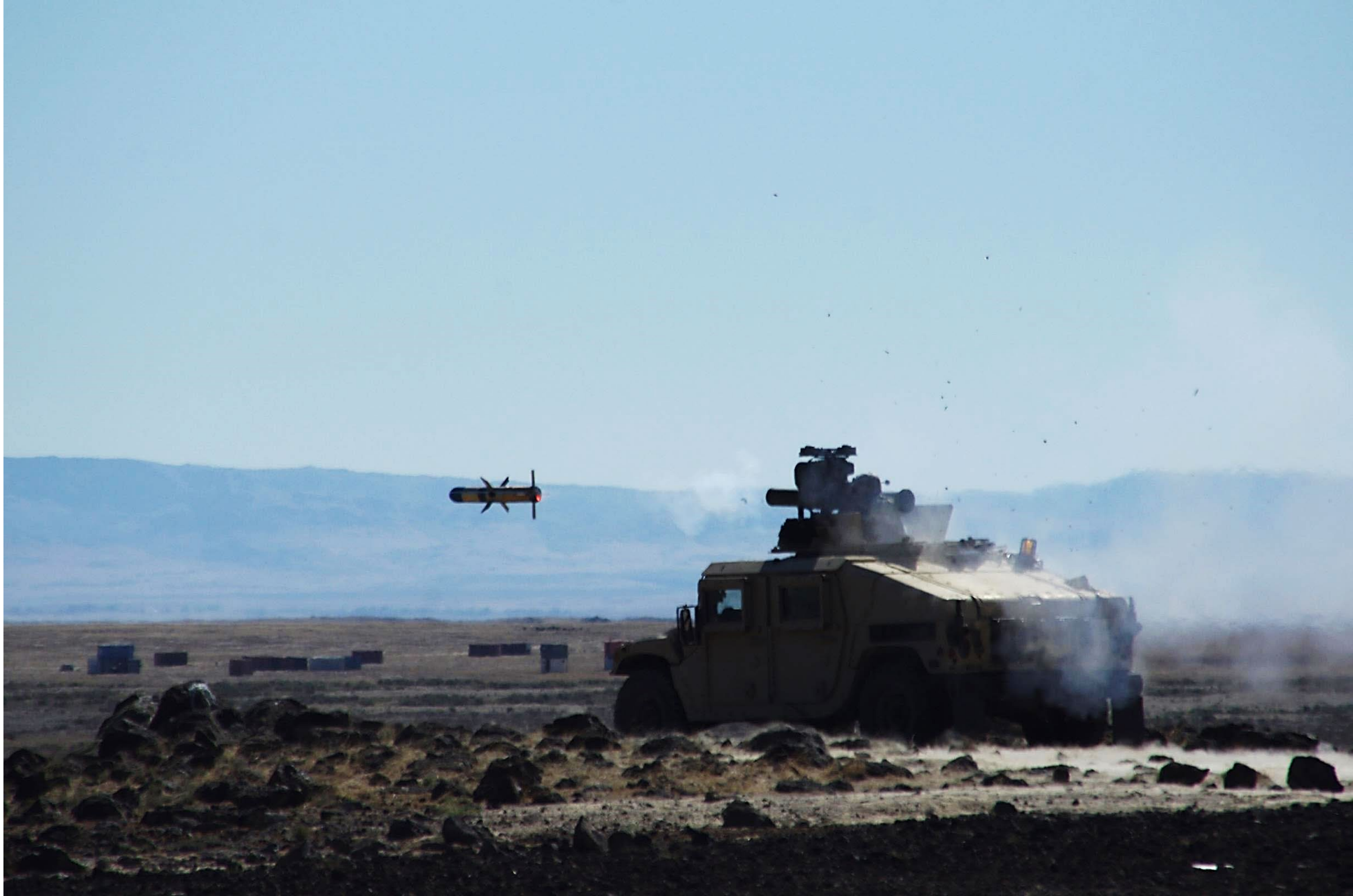
1st Squadron, 82nd Cavalry Regiment conducts TOW Missile training near Boise, Idaho 2013 10"x16" Digital Print