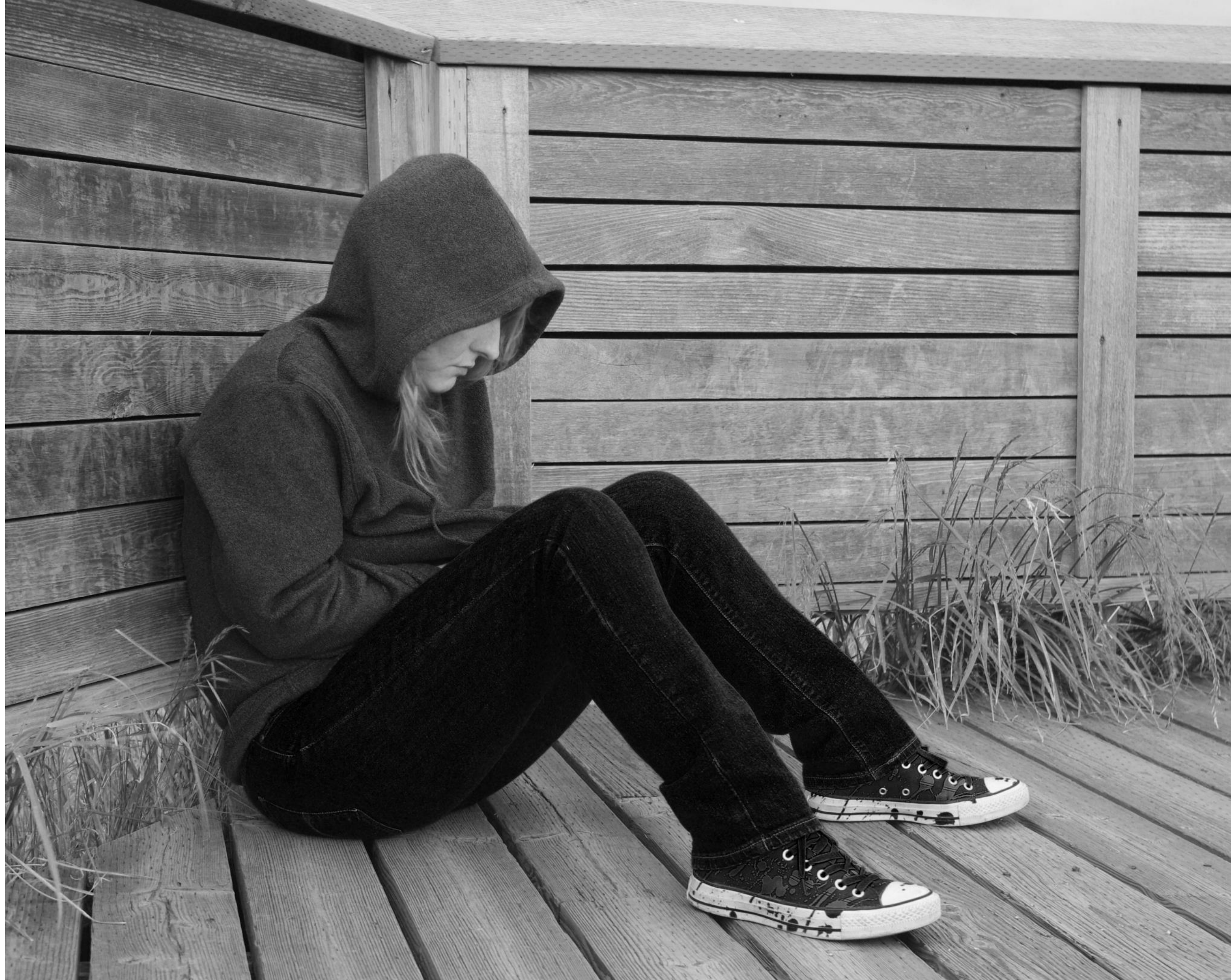
Desperation 2011 16"x20" Digital Print