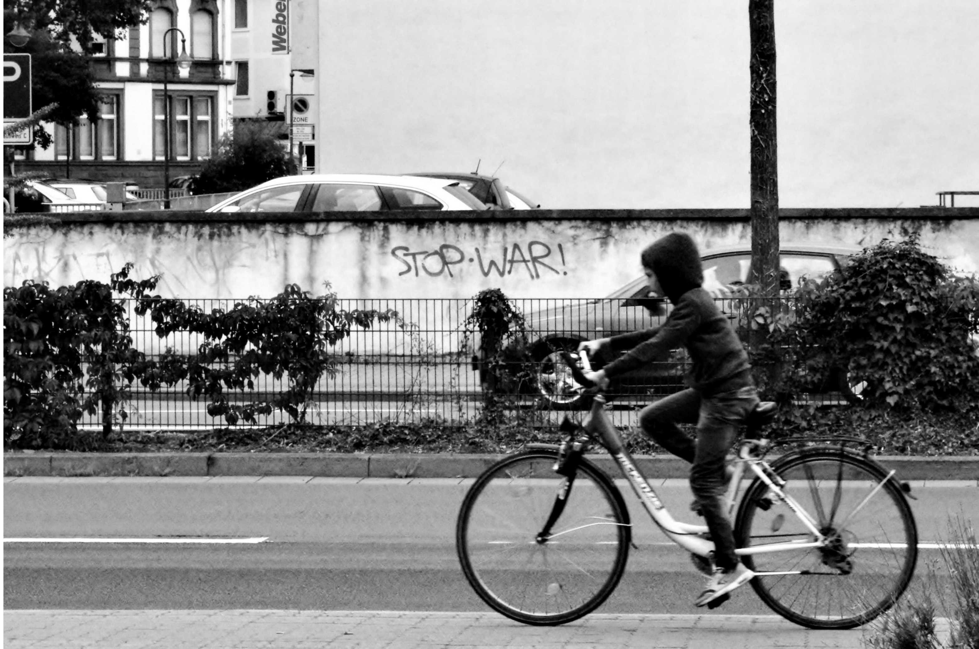
Stop War 2016 16"x20" Digital Print