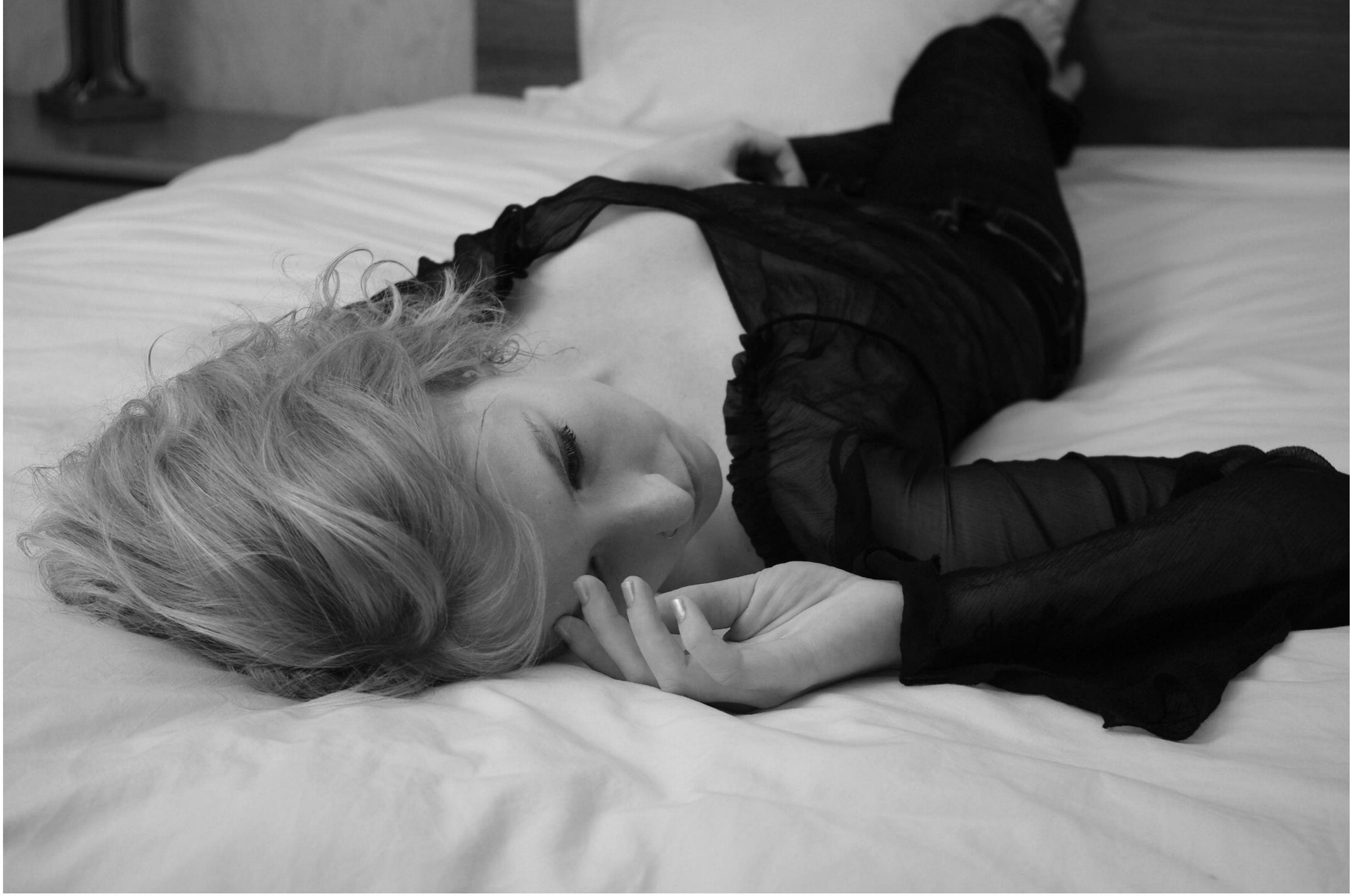
Decisions 2013 10"x15" Digital Print