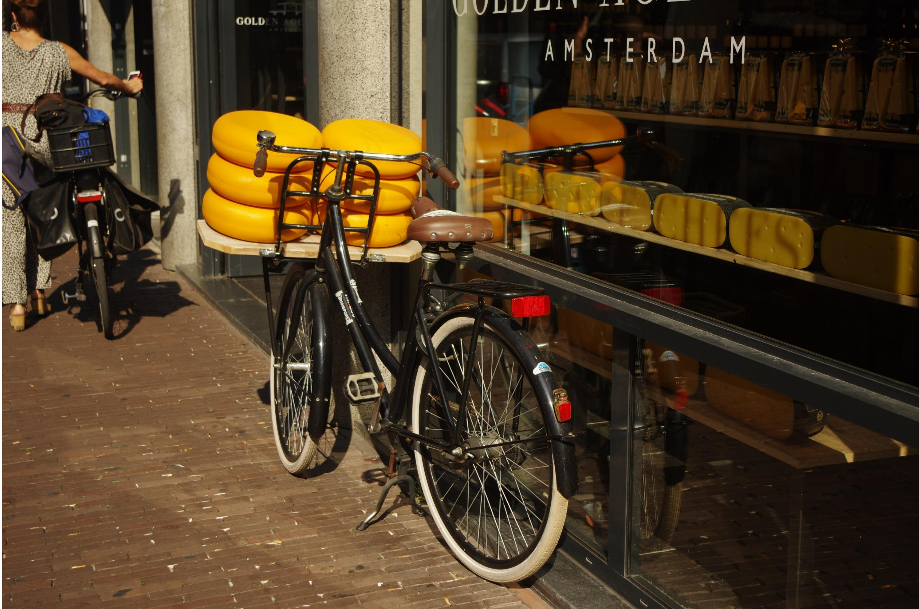
Zeg Kaas (Say Cheese) 2016 16"x20" Digital Print